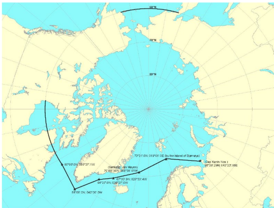
Figure 2 - Maximum extent of Arctic waters application 3

3 It should be noted that this figure is for illustrative purposes only.